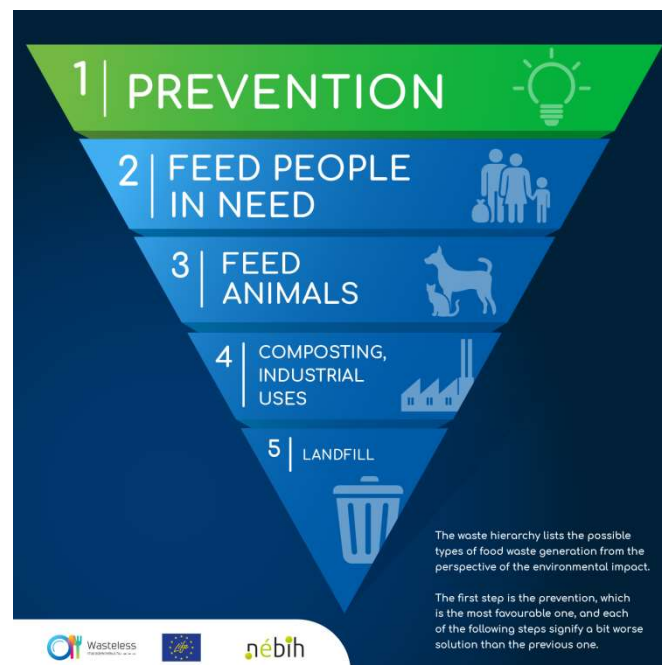
Figure 2. Waste Hierarchy

“Waste policy should also aim at reducing the use of resources and favour the practical application of the waste hierarchy.” (Figure 2)